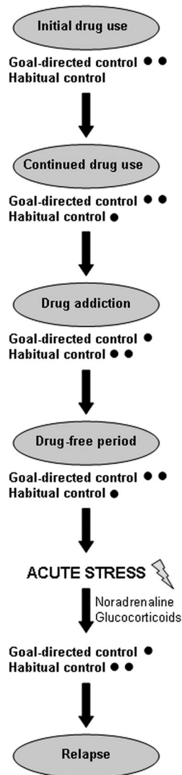
Figure 2. Acute stressors and relapse. The development of drug addiction involves a transition from goal-directed to habitual control of action. Acute stress may reinstate the habitual control of behavior after a drug-free period and may increase by this means the risk of relapse. The black dots indicate the strength of the goal-directed versus habitual control of action.